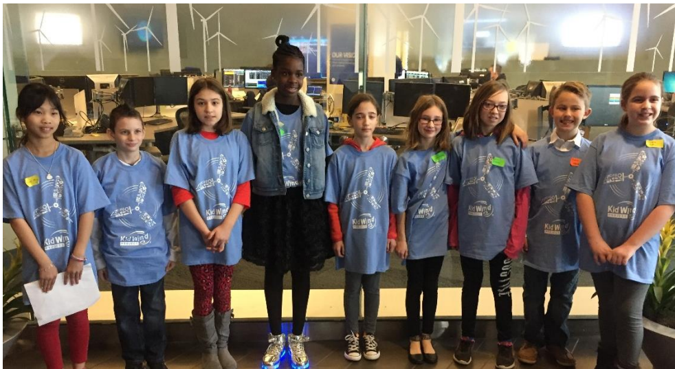
South Colonie Students who competed in GE KidWind Competition

http://cbs6albany.com/news/local/student-scientists-show-their-best-wind-turbines